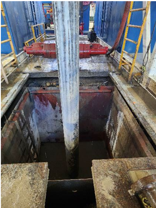
Figure 1 - Surface casing set in place

The objective of the Amistad-2 production well is to maximally intercept the Unit 1B oil reservoir and be left online as an additional producer. The shallower Unit 1A oil reservoir is a viable future target in its own right.