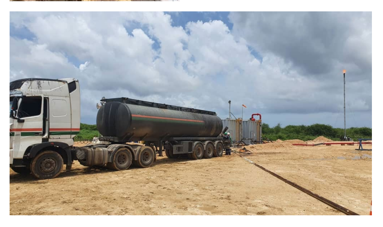
Figure 1 – Testing of Unit 1B in Amistad Formation (L-R: sampling, flaring, first tanker load)