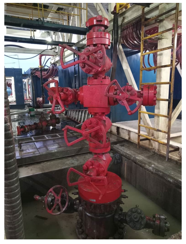
Figure 2 - Alameda-2 completion successfully run

The test in Unit 1B has confirmed the presence of moveable oil considerably lighter than that observed in Unit 1A. The fluid produced to surface was close to 100% oil with almost zero comingled water and no formation water observed in either the test or the wireline logs.