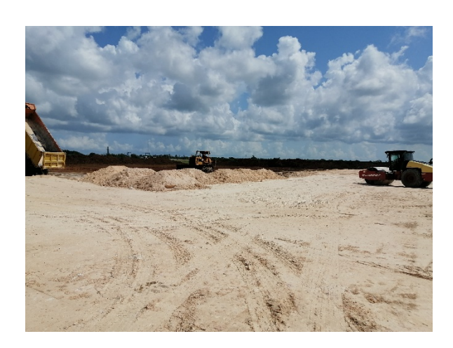
Zapato #1: Well pad construction

A full complement of staff from both Melbana and Sonangol are now on site and operations are continuing normally. The Company's project office, adjacent to Sherritt's operations base in Varadero, has now been fully furnished and operational control of