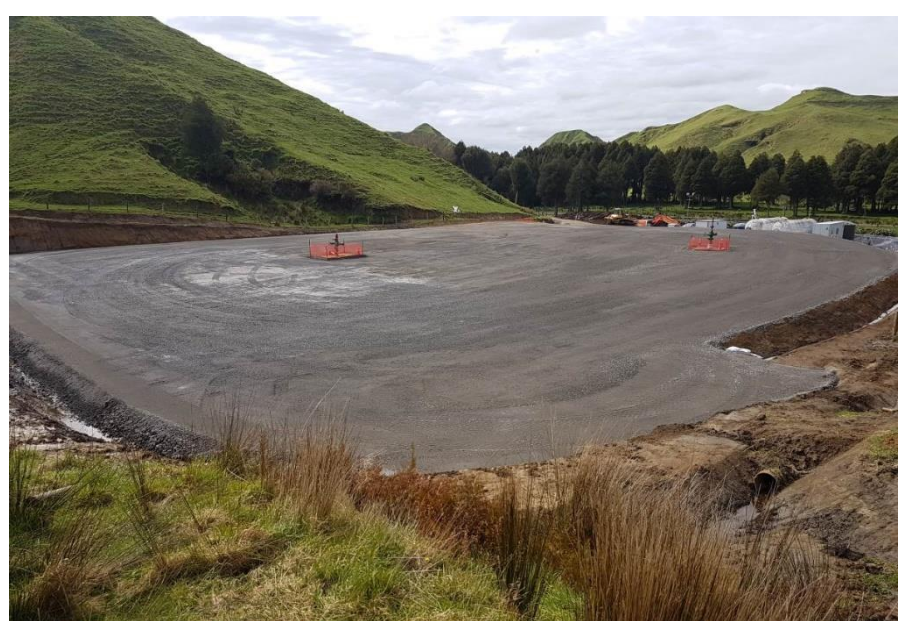
Figure 1 - Completed Pukatea drilling pad with existing Puka-1 and Puka-2 suspended wells protection zones visible