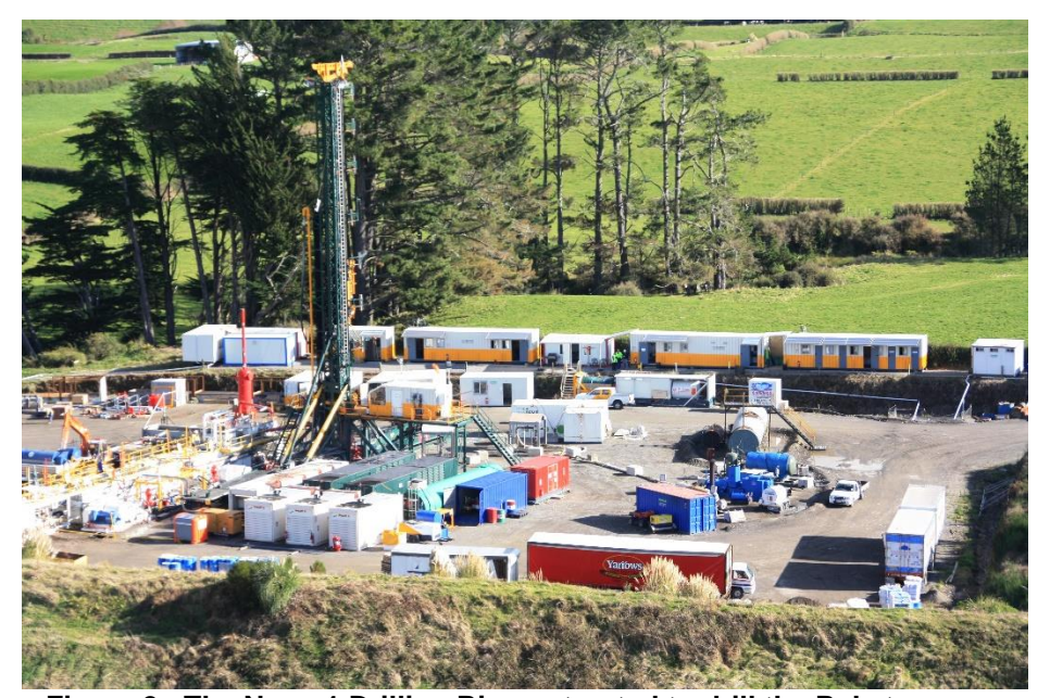
Figure 2 - The Nova-1 Drilling Rig contracted to drill the Pukatea prospect

The Pukatea prospect is a mature high impact exploration opportunity, targeting a highly productive conventional reservoir with prospective resources attributable to the Pukatea prospect estimated to range from 1.3 to 40 million barrels of oil equivalent (MMboe) (Low-High estimates) with a Best Estimate of 12.4 MMboe* (see the following table) and a chance of success of 19% (see table below).