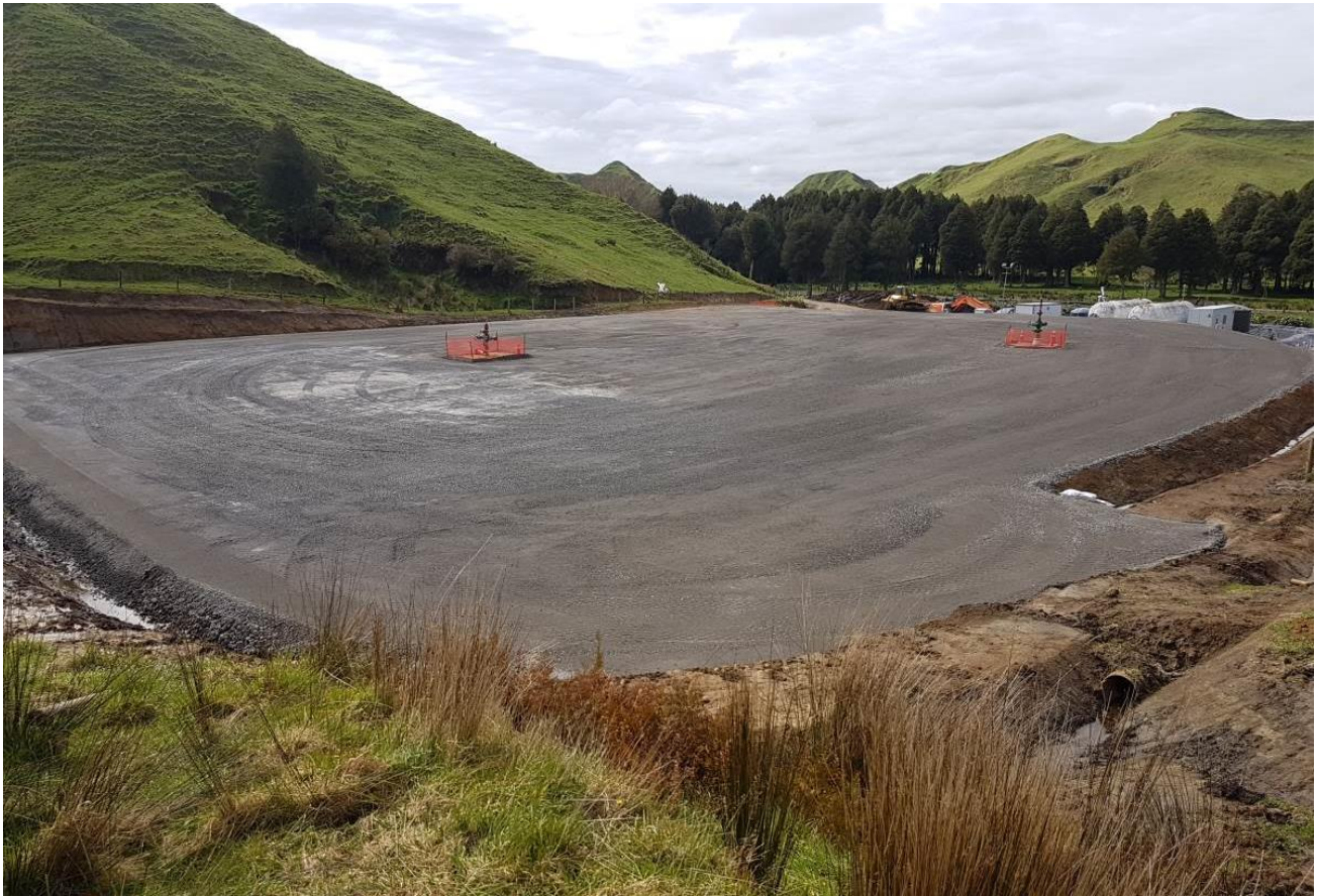
Figure 1 - Completed Pukatea drilling pad with existing Puka-1 and Puka-2 suspended wells protection zones visible