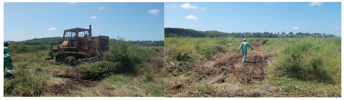
Figure 1. Cuban Contractor at proposed well site area (left) and proposed location of access to drilling pad (right)

Field work has commenced on the Company's Block 9 PSC acreage with local contractors undertaking initial site surveys of the area around the proposed Alameda-1 well location, the nearby supporting campsite and local access roads.